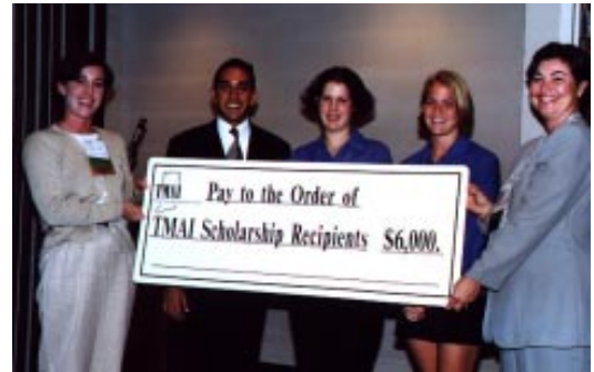
Pictured above, the 1999 TMAI Scholarship winners.

One of the features that distinguishes TMAI from other regional or national treasury associations is its scholarship program. TMAI began awarding scholarships in 1992. Since that time, the Association has awarded over $41,000 in scholarships to students majoring in finance and attending Indiana institutions of higher learning. TMAI will continue this tradition of recognizing promising students by awarding five scholarships at the 2000 annual conference. Each 2000 winner will receive a $1,000 scholarship to the college or university they are attending. Proceeds from TMAI's annual conference help support the scholarship program. Plan to meet these talented individuals during the conference scholarship luncheon on Thursday.